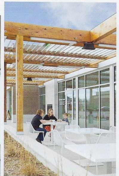
ecafé's modern design is spacious and clean, using vibrant colors and natural light to keep workers energized. The workpods even offer some truly picturesque nature views.