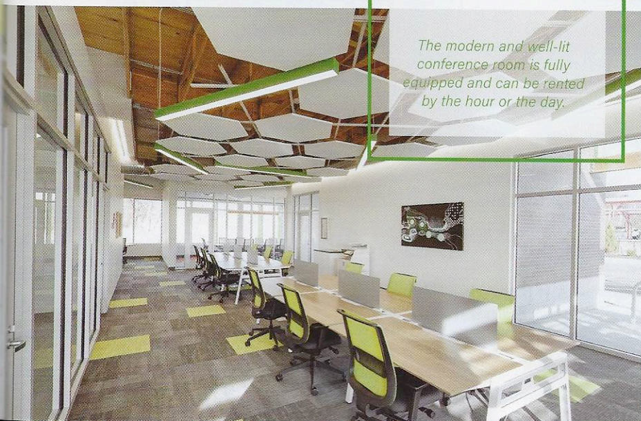
The modern and well-lit conference room is fully equipped and can be rented by the hour or the day.

As tempting as the menu is, ecafé's design aesthetic is equally appetizing. The modern space is spacious and clean, using vibrant colors and lots of light to keep workers energized. And there are some truly picturesque nature views from the work pods.