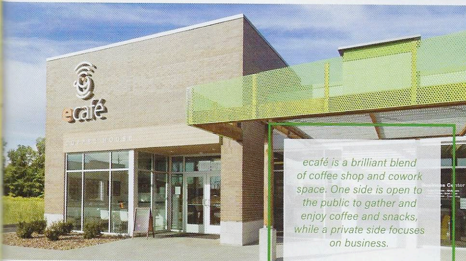
ecafé is a brilliant blend of coffee shop and cowork space. One side is open to the public to gather and enjoy coffee and snacks, while a private side focuses on business.